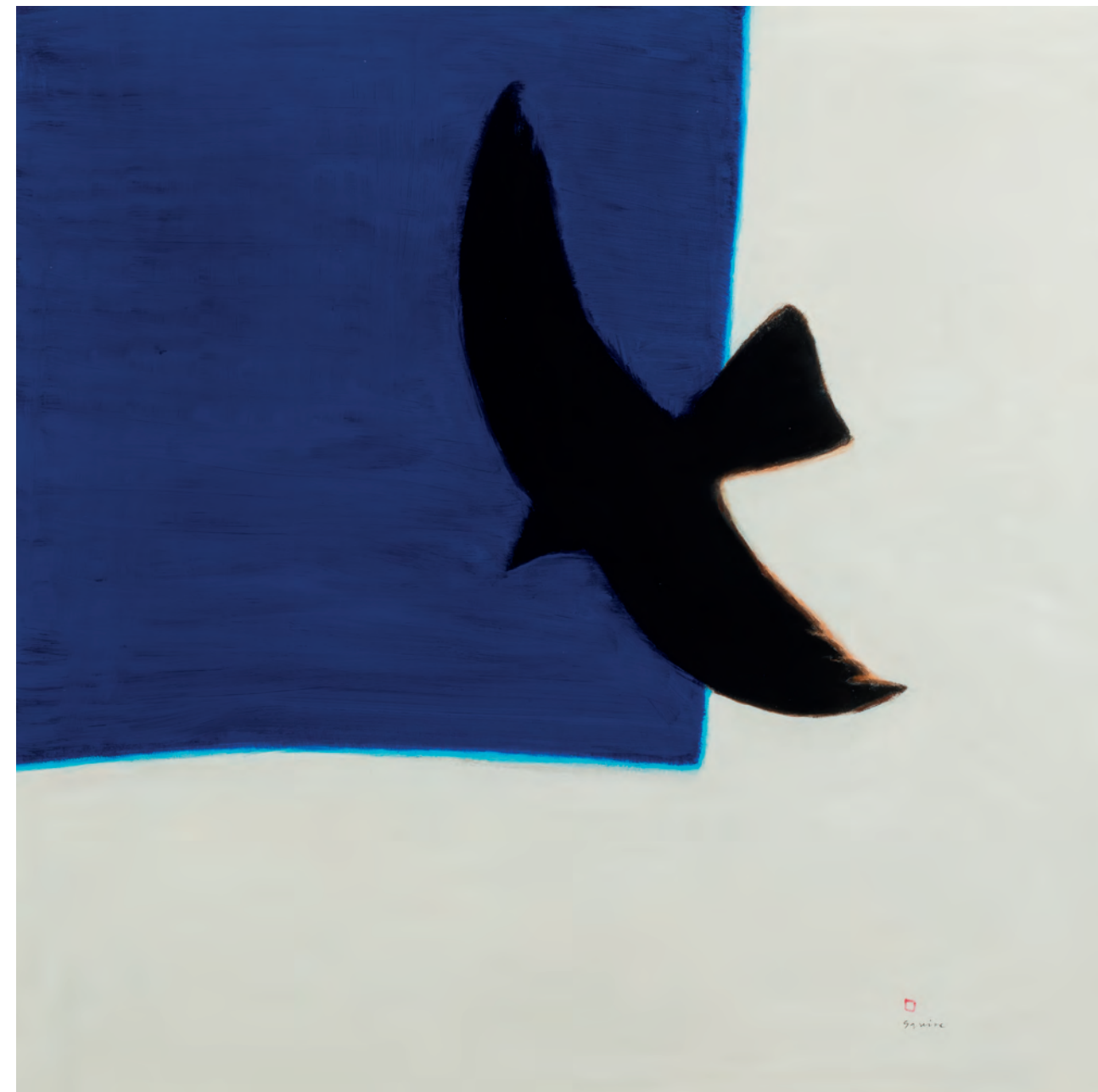
Bird on Blue Oil on canvas 35 x 35 inches (right)