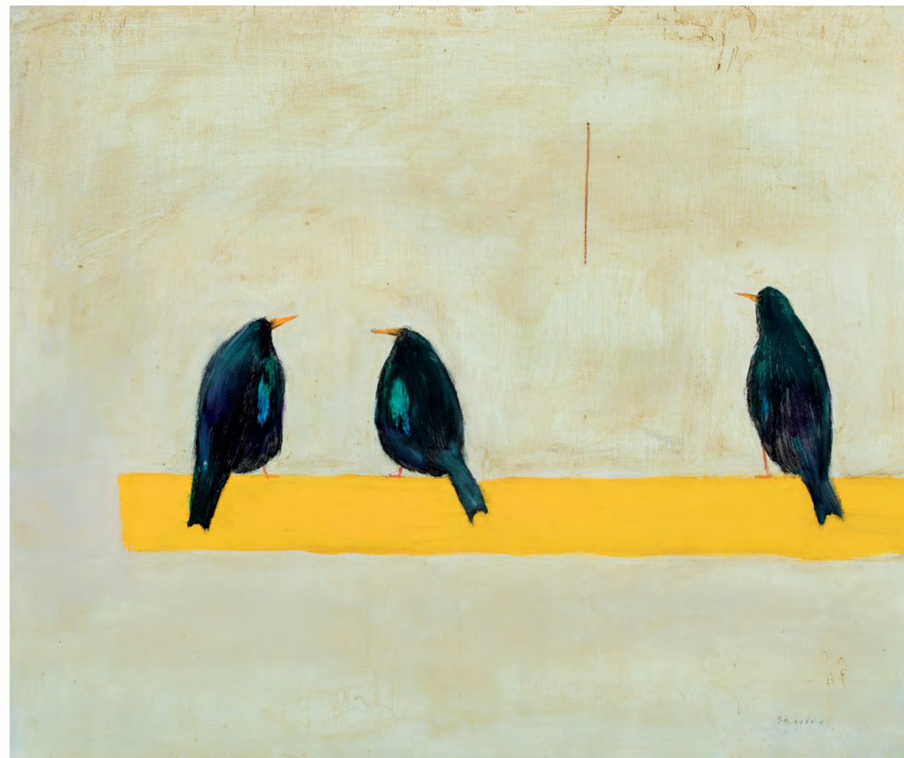
Three Starlings Oil on panel 20 x 24 inches