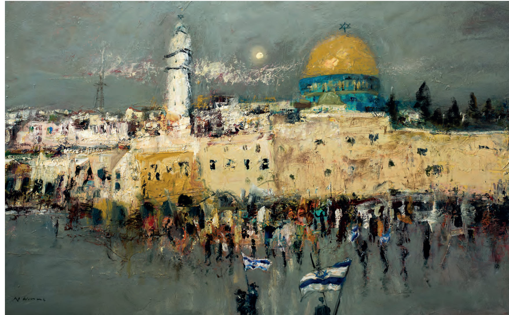
Jerusalem Now Oil on panel 40 x 48 inches