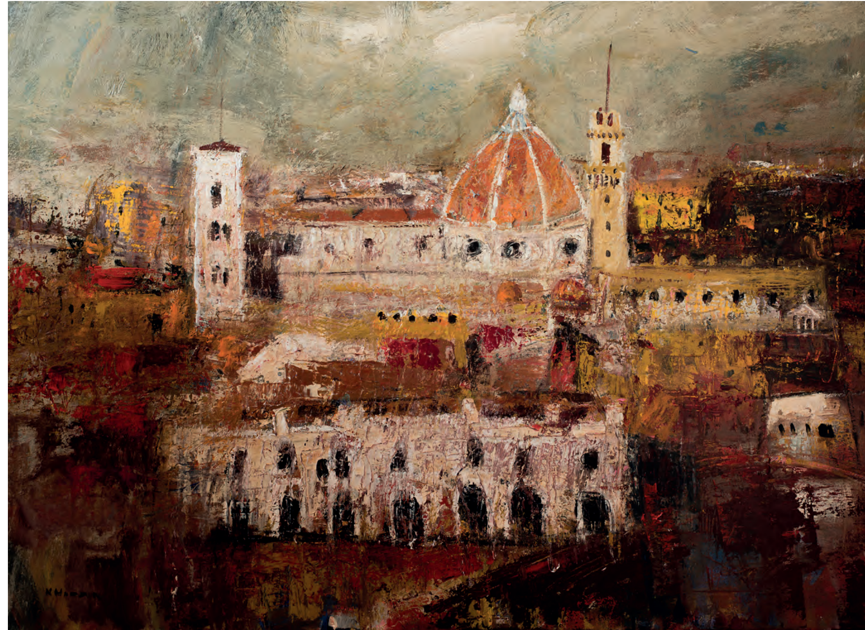
Florence Oil on panel 39 x 55 inches (right)