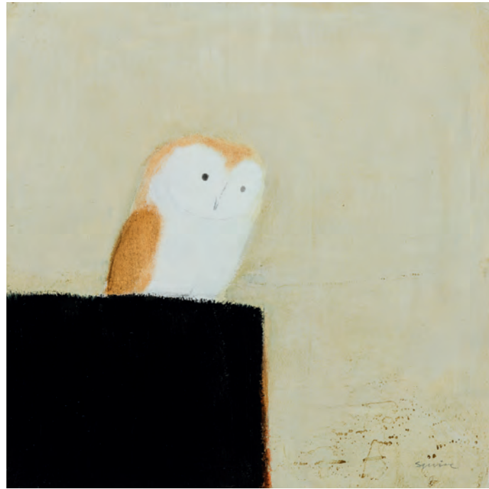
Owl Oil on panel 12 x 12 inches (above)