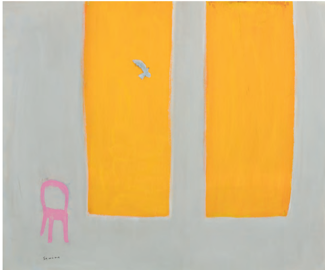
Chair with Dove Oil on panel 20 x 24 inches