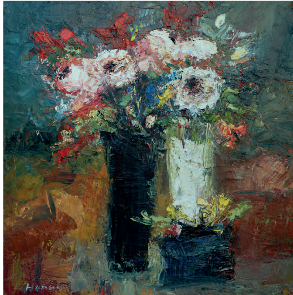
Flowers Oil on panel 30 x 30 inches