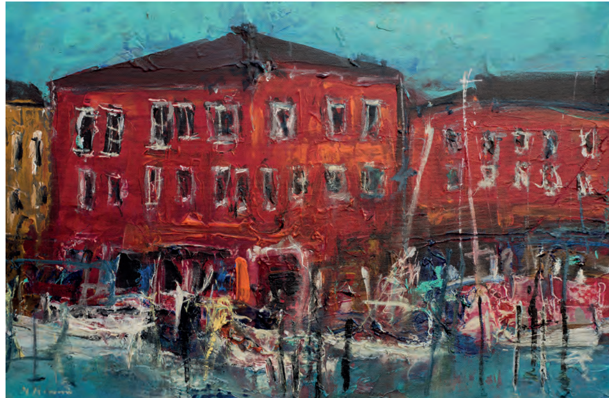
Venice Oil on panel 20 x 30 inches (above)