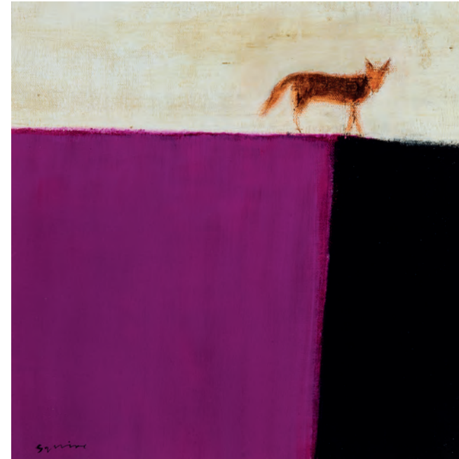
Fox and Magenta Oil on panel 12 x 12 inches