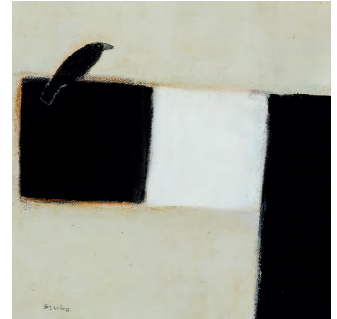
Crow on Black and White Oil on panel 12 x 12 inches