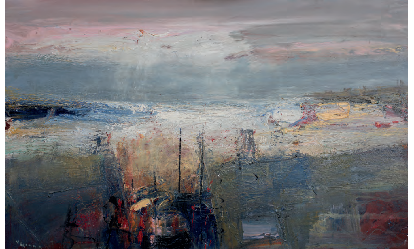
Scottish Shore Oil on panel 40 x 48 inches (right)