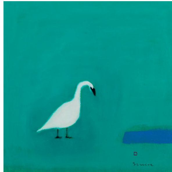
Swan Oil on panel 10 x 10 inches (above right)