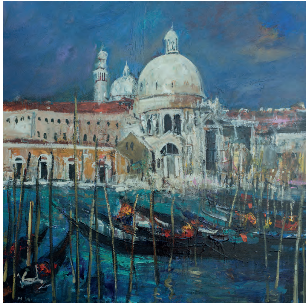
St. Marcos, Venice Oil on panel 39 x 39 inches