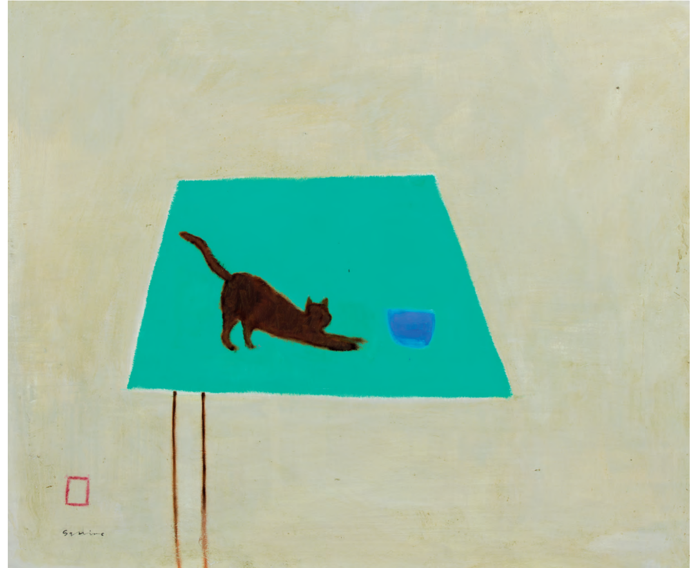
Cat on a Table Oil on panel 20 x 24 inches (above)