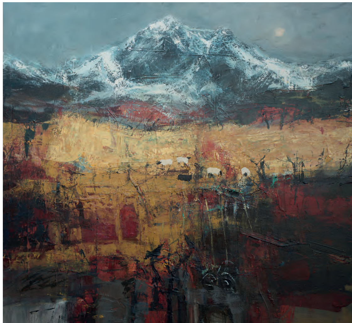
Ben Nevis Oil on panel 39 x 39 inches (front cover)