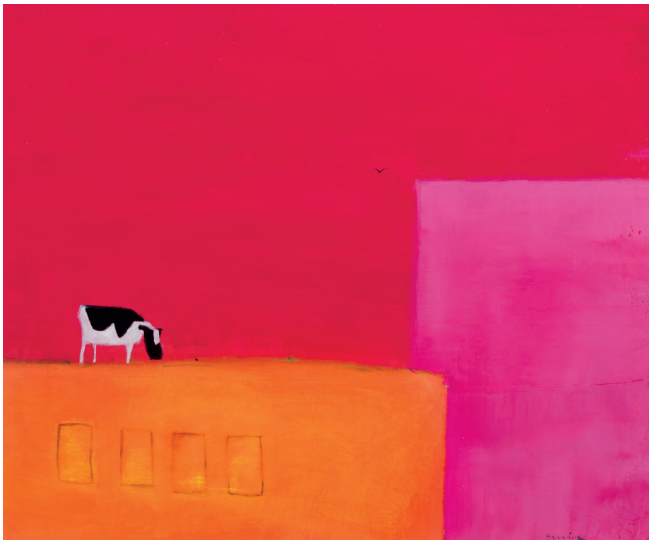
Roof Garden Oil on panel 20 x 24 inches