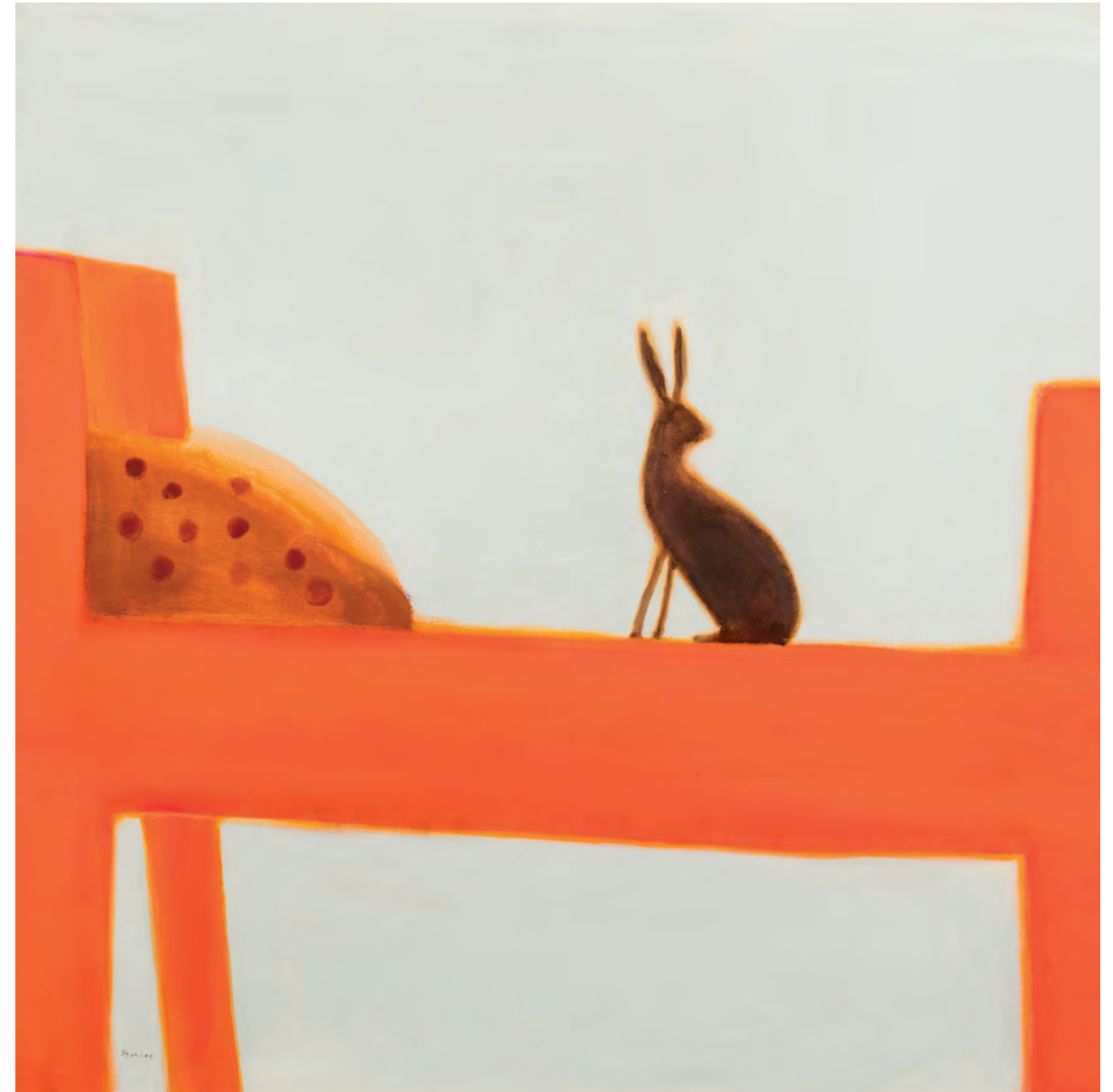
Hare on Bed Oil on canvas 35 x 35 inches