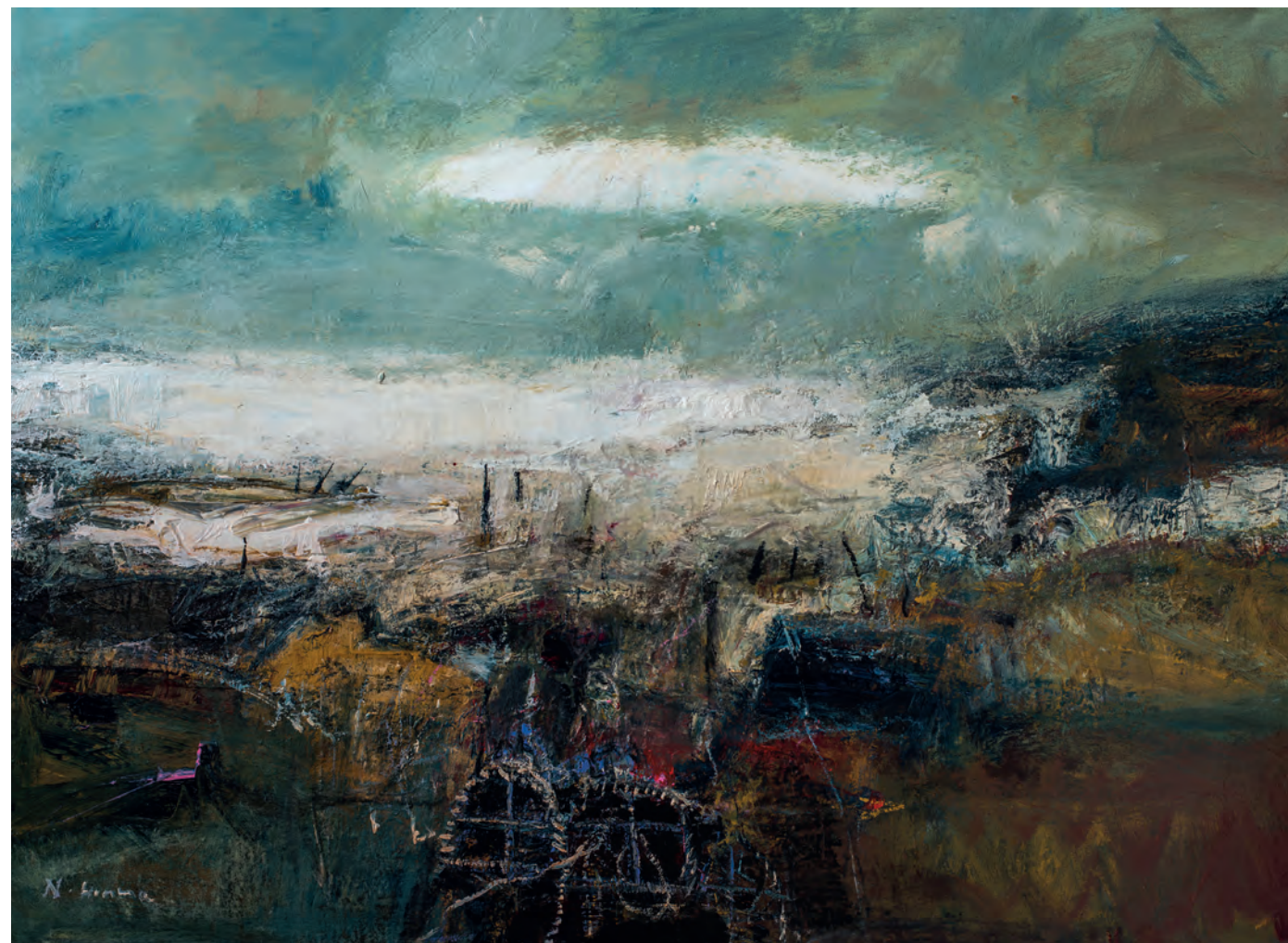
Washed Creels West Coast Scotland Oil on panel 43 x 55 inches