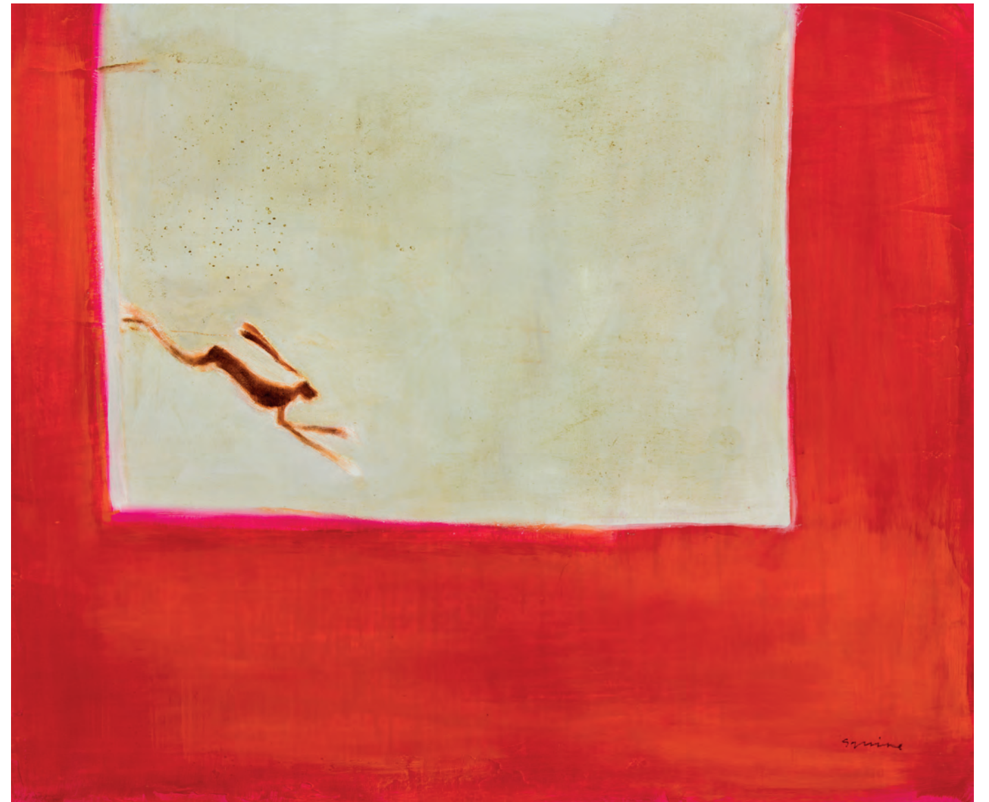
Leaping Hare Oil on panel 20 x 24 inches