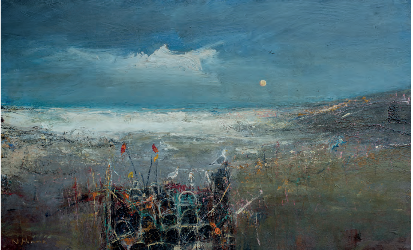
Lobster Creels Oil on panel 34 x 38 inches