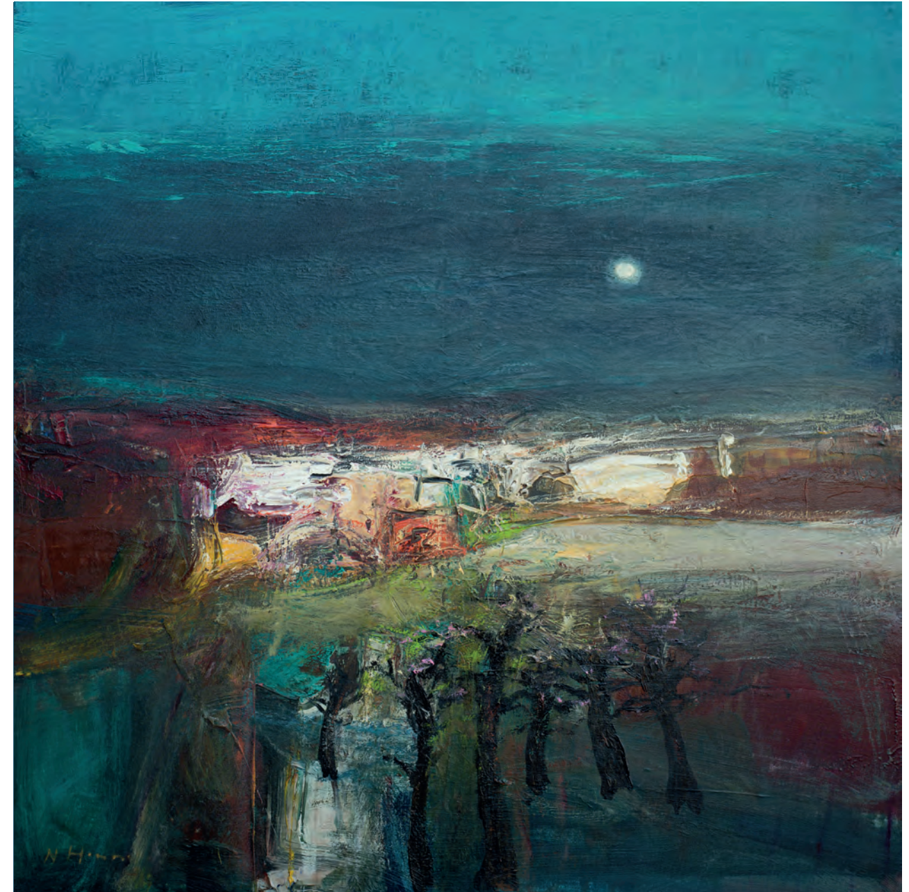
Moonlight Over Skye Oil on panel 39 x 39 inches (right)