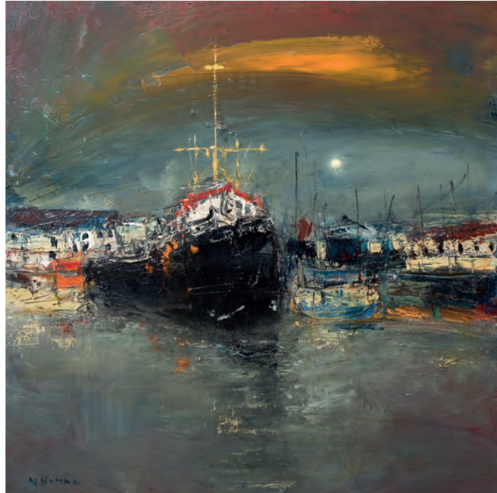
St. Monans Oil on panel 12 x 12 inches (above)