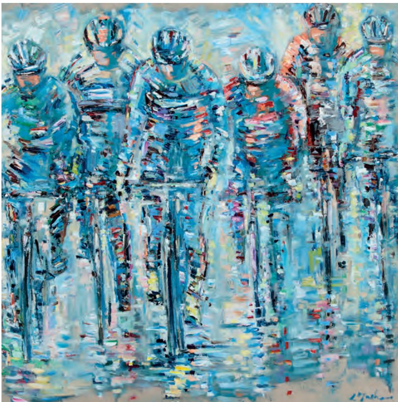
The Peloton Oil on linen 36 x 36 inches