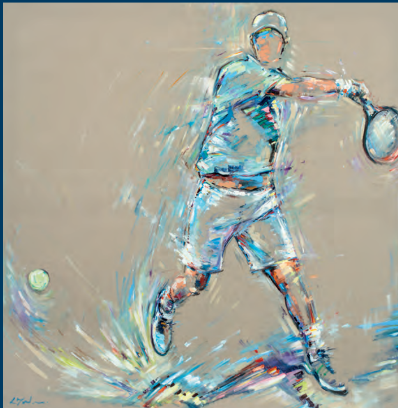
Bated Breath Oil on linen 54 x 54 inches

3 Seymour Place, Marylebone, London, W1H 5AZ Tel: +44 (0)207 935 3595 Email: enquiries@thompsonsgallery.co.uk