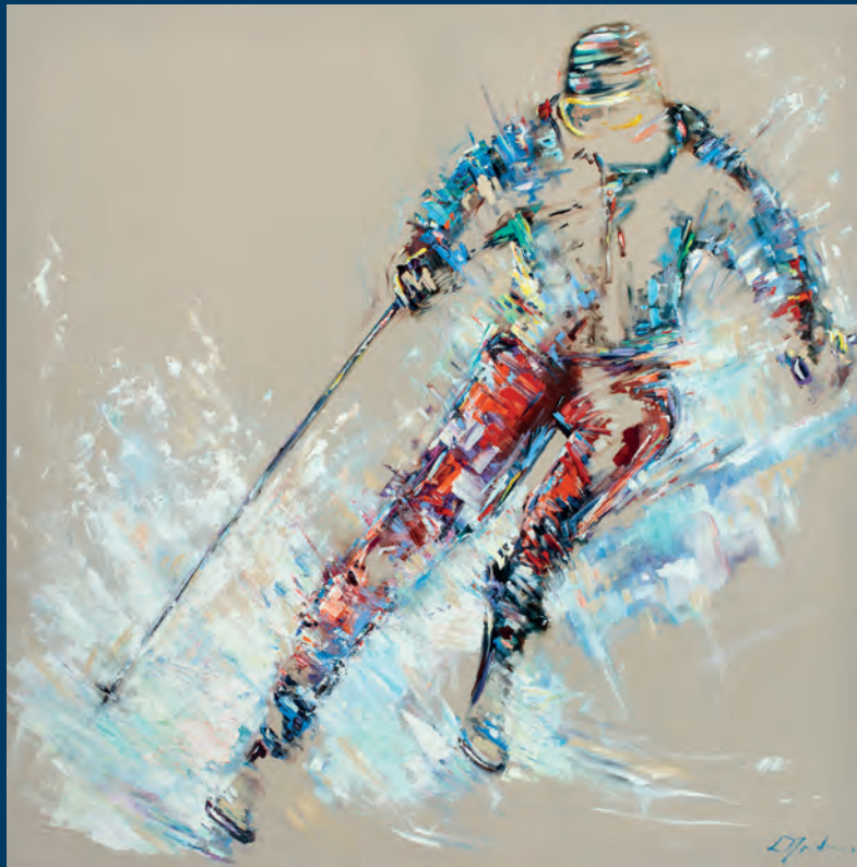
Fresh Tracks Oil on linen 54 x 54 inches