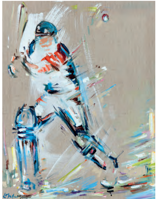
Hitting for Six Oil on linen 20 x 16 inches