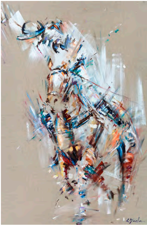
Winding Up Oil on linen 36 x 24 inches