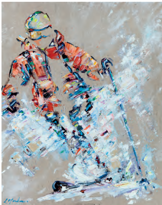
Pow! Oil on linen 20 x 16 inches