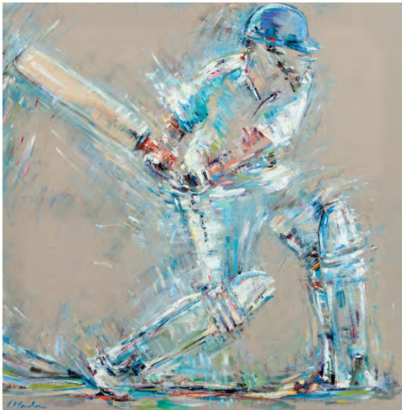
The Anchor Oil on linen 36 x 36 inches