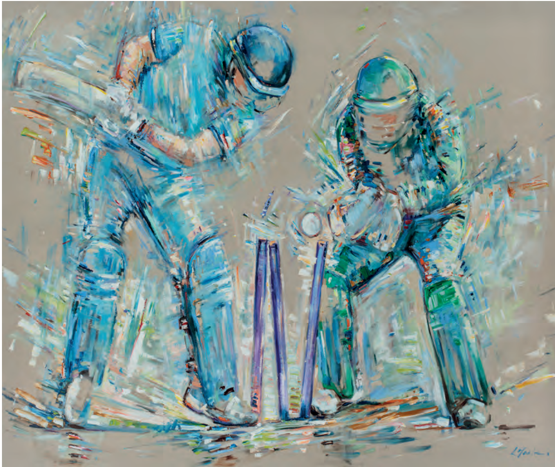
No Appeal Needed Oil on linen 50 x 60 inches