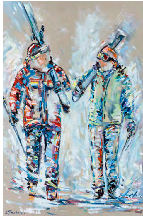
The Piste Awaits Oil on linen 36 x 24 inches